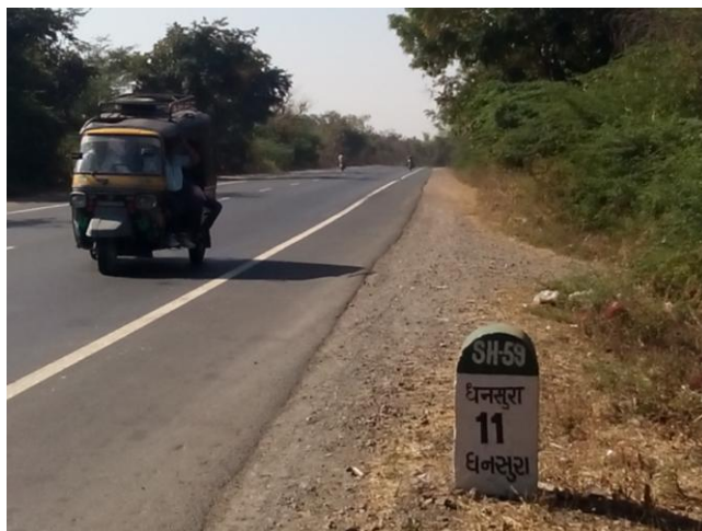
Fig 3: Ipt mode on Dhansura road