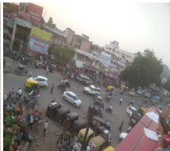
Fig 4: traffic congestion in Modasa city