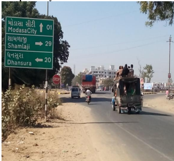
Fig 2: Ipt mode on meghraj and shamlaji road