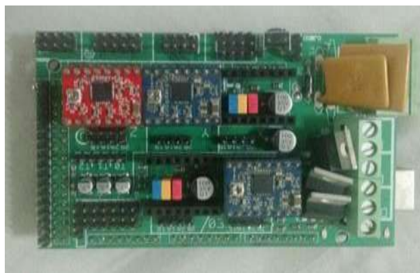
Figure 2: RAMPS 1.4 with drivers