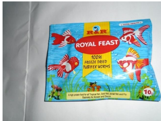
Figure -1(b) Dried Live Frozen Feed