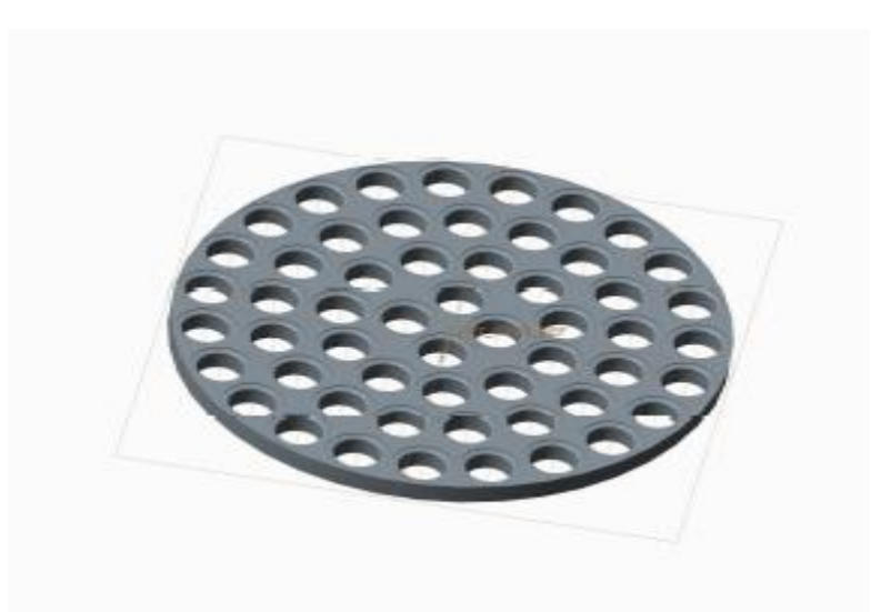
Fig.2 Fifty five Cavity Bakelite Fixture for Rubber bushes