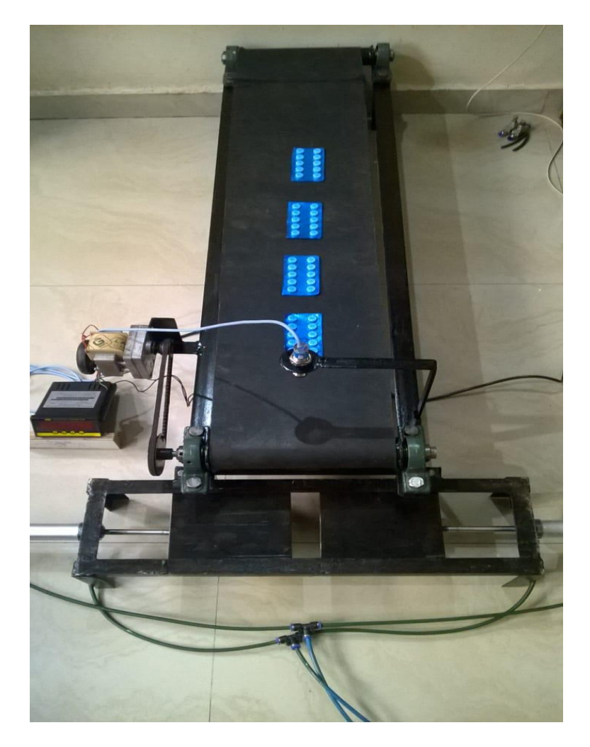
Figure 1. Propose automatic tablet counting & shifting mechanism in belt conveyor