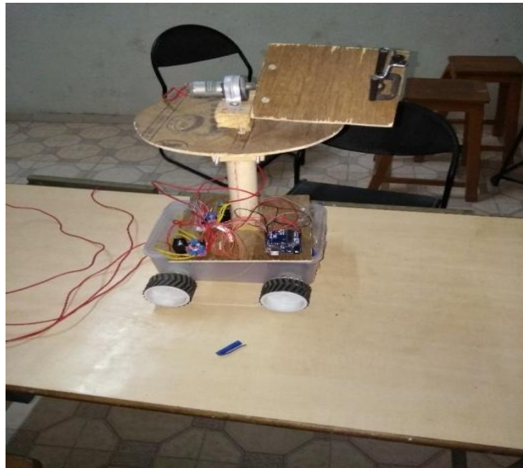
Figure 1 WI-Cam stand prototype

Wi-cam stand is a wired prototype using it which we can operate the movements of camera stand and can be use easily from a specific distance. We can operate movements like forward & reverse movements of stand having a Robo car in its base. We can operate movements like pan & tilt to rotate the camera in all directions and to rotate it in a specific angle. This was our wired prototype which we had made for Design engineering project and for our final year project we continued this project but it is wireless and can be operated using a smartphone from a specific distance.