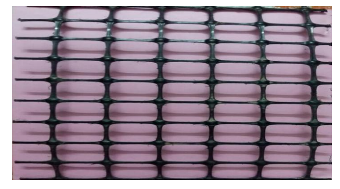
Fig 2 Geogrid

Geogrid is one of the polymeric materials classified under geo-synthetics manufactured from the polymers such as polyester, polypropylene, and polyethylene. Uniaxial geogrids are used for the grade separation appliances in steep slope and retaining walls while biaxial geogrids are used in roadways to take vibrations