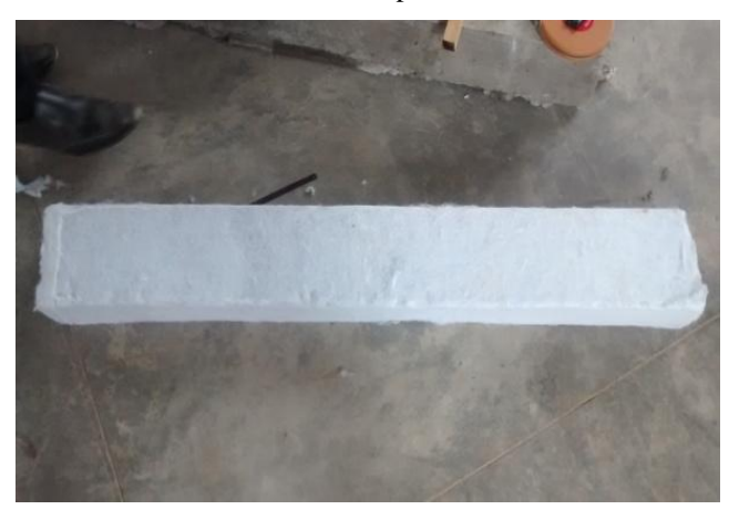
Fig 5 External Wrapping by white cement

After 28 days of curing the specimen was dried in air. And the specimen was externally wrapped by white cement before the testing of beams. It shows the clear crack formation of the specimen