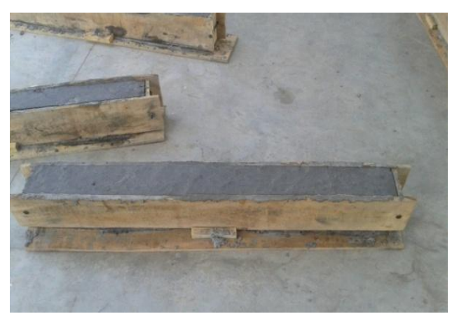
Fig 4 Formwork with Beam Specimen

The reinforcement cages were placed in the moulds and cover between cage and form provided was 25 mm. The concrete was placed into the mould immediately after mixing and well compacted. They are cured in water for 28 days. After 28 days of curing the specimen was dried in air and white washed.