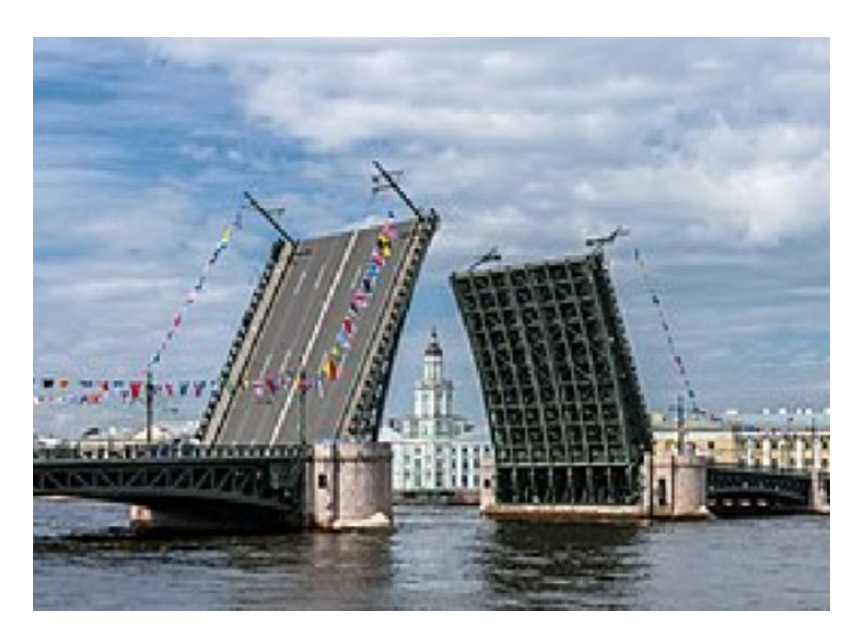
"Figure 2. Palace Bridge in Saint Petersburg, Russia"