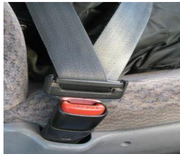
Figure 2. Mechanism of seat belt

This system is already implemented in almost all Cars but still we are using this system because the measure reason of 'death in accidents' is avoidance of wearing seatbelts. A mechanism of seat belt is like one switch. Fig. 2 below shows the mechanism of Seat belt[3].