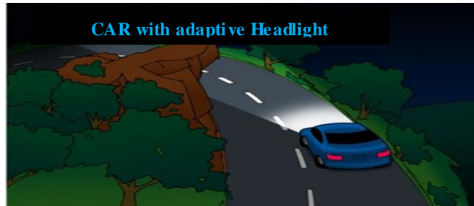
Figure 5 B. Car with adaptive headlight

Adaptive Headlight is one extra headlight which is place on the car bonnet. In the daytime headlights is off hence no need for system of adaptive headlight to be on. A switch is used to detect headlight on/off and module is operated accordingly. In the module when steering wheel is moved by a small degree say 5, the headlight does not move but it moves if motion is more than 5 degrees and even if motion is greater than 20 degrees then the module does not move the headlight further. Hence the motion is restricted to 20 degrees which is sufficient to view during the turns Fig. 6 Shows the mechanism of adaptive headlight.[4]