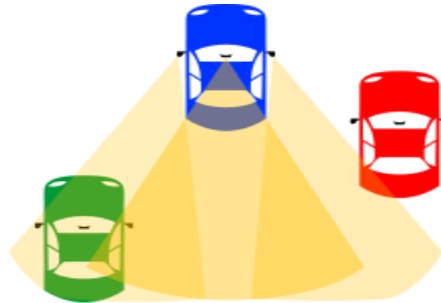
Figure 3. Concept of blind spot

Fig. 3 Shows the concept of Blind spot. The blue car's driver sees the green car through his mirrors but cannot see the red car without turning to check blind spot (the mirrors are not properly adjusted)