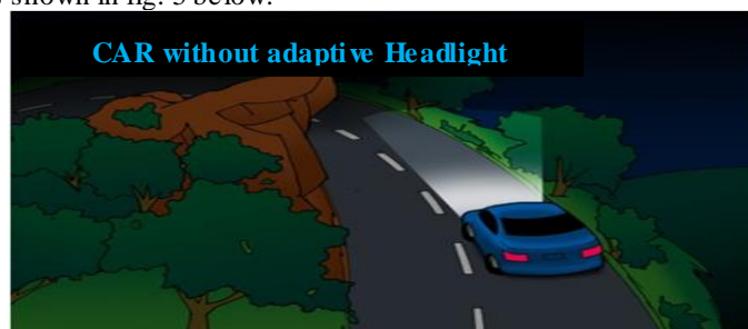
Figure 5A. Car without adaptive headlight

All car have 2 fix headlights. But there is some disadvantage of this system. During night time focus of our headlight goes straight. So During at sharp turn, if there is obstacle then that obstacle is not visible and then there is a large chance of accidents. One example is shown in fig. 5 below.