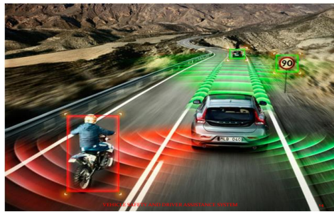
Figure 4. Blind spot detection using ultrasonic sensor

So we are using ultrasonic sensor to detect blind spot. When we give indicator or press indicator switch, then ultrasonic sensor continuously transmits ultra sonic waves. When obstacle is detected then buzzer will start ringing. Fig. 4 below shows the blind spot detection using Ultrasonic sensor.