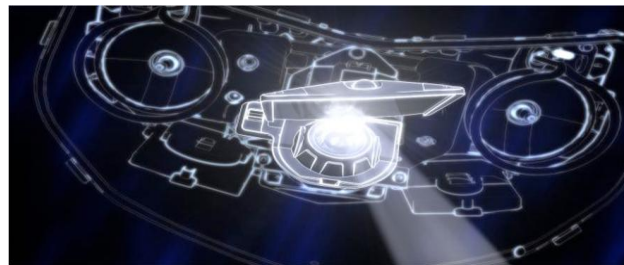
Figure 6. Mechanism of adaptive headlight.

Adaptive Headlight is one extra headlight which is place on the car bonnet. In the daytime headlights is off hence no need for system of adaptive headlight to be on. A switch is used to detect headlight on/off and module is operated accordingly. In the module when steering wheel is moved by a small degree say 5, the headlight does not move but it moves if motion is more than 5 degrees and even if motion is greater than 20 degrees then the module does not move the headlight further. Hence the motion is restricted to 20 degrees which is sufficient to view during the turns Fig. 6 Shows the mechanism of adaptive headlight.[4]