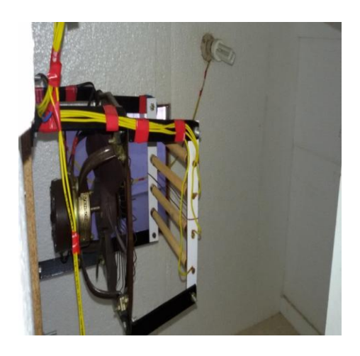
Figure 3. Inside view of closed space model