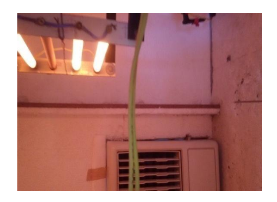
Figure 4.Heater on condition in room