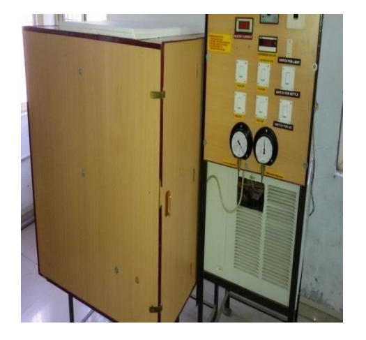
Figure2. Closed space volume room model