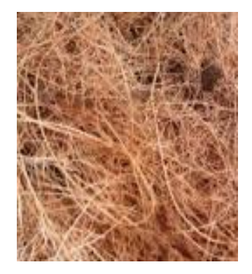
Figure 1. Coconut husk

India is the third largest producer of coconut in the world producing 9.4 million tons from this about 50% coconut husk is 4.2 million tons per year produced. Coconut husk have thermal conductivity K in range 0.054-0.143 W/m K and average density of coconut husk is 386 Kg/m<sup>3</sup>. There are two types of coconut fibers, brown fiber extracted from matured coconuts and white fibers extracted from immature coconuts. Coconut fibers are commercial available in three forms, namely bristle (long fibers), mattress (relatively short) and decorticated (mixed fibers). The physical, chemical and mechanical properties of coconut fiber are presented in table 1. In this study from literature review the thermo physical properties of environmentally friendly biodegradable agricultural by-products such as oil palm, coconut, and sugar cane were investigated to ensure its ability for use for building thermal insulation. Experimental investigation of agro wastes materials were done using ASTM C518 standard which is normally use for measure the thermal conductivity of material under the steady state one dimensional test conditions with heat flow. In this experimental testing condition four parameters fiber mean diameter, density; Fiber length and thermal conductivity have measured for selected three materials oil palm, coconut, and sugarcane.