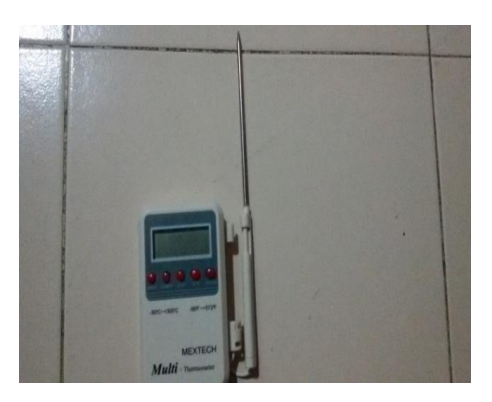
Figure 5.Digital temperature meter